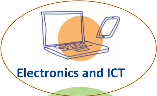
Electronics and ICT