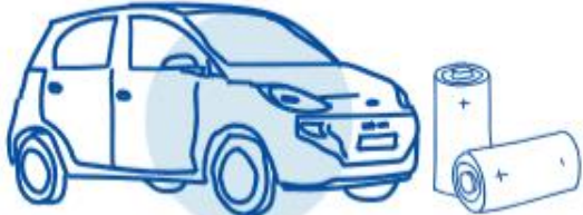
Batteries & vehicles