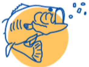
Food, water & nutrients